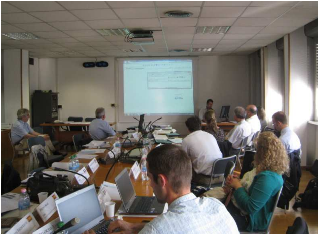
Kick-off meeting Rome (Italy) 26-27 June 2014 Hosted by ENEA