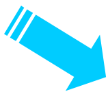
3rd annual meeting held in Pola (Croatia) on 27-28 May 2014 hosted by AZRRI