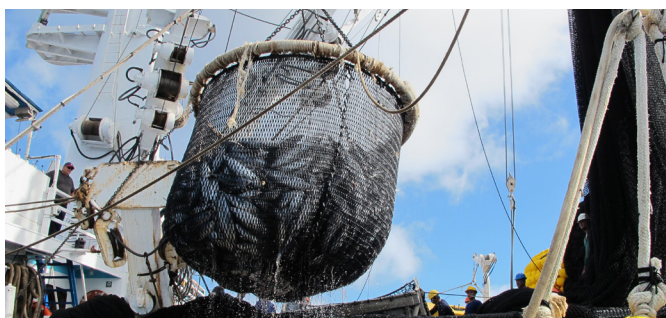
ISSF (2012)